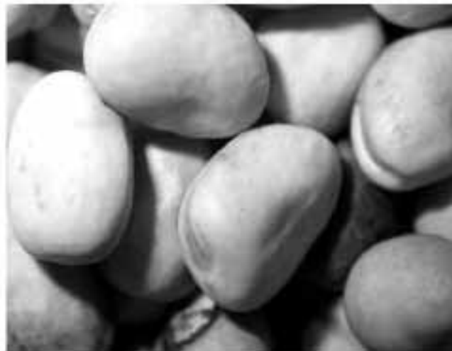
Figure 1. Zero-tannin Snowbird fababean

Fababean prefers cool, moist growing conditions. It is best suited to the Parkland and Peace River regions of Alberta. It grows well on deep medium-textured soils that have a good water-holding capacity. Fababean, however, does not tolerate hot, dry weather well. Hot, dry conditions cause droopy plants and reduce flower and seed set.