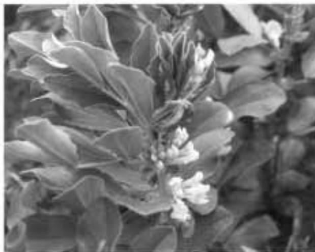
Figure 2. Snowbird fababean is a zero-tannin, white-flowered variety

Table 3 summarizes the main effect of dietary supplemental protein source on an array of pork quality measurements conducted 72h post-slaughter. Diet only affected the colour (Japanese scale), pH and drip loss measured in the loin eye (L. thoracis muscle). Pork from pigs fed 50% ZT fababean and 50% SBM was slightly darker (0.37 points) than that of pigs fed either SBM alone or field pea. Muscle pH for pigs fed field pea was lower (0.065 points) than for pigs fed ZT fababean or 50% ZT fababean and 50% SBM. Drip loss in chops from pigs fed ZT fababean or 50% ZT fababean and 50% SBM was lower (1.18 percentage points) than that of pigs fed SBM alone or field pea.